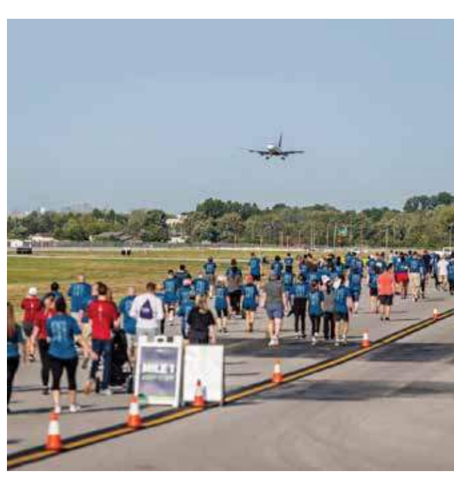
Unique taxiway 5K at John Glenn International supports Honor Flight Columbus