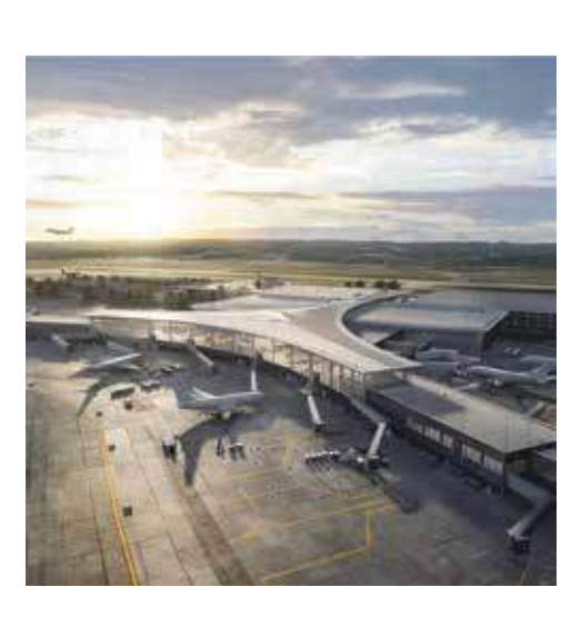
John Glenn Columbus International Airport leaders detail next steps for $2B terminal