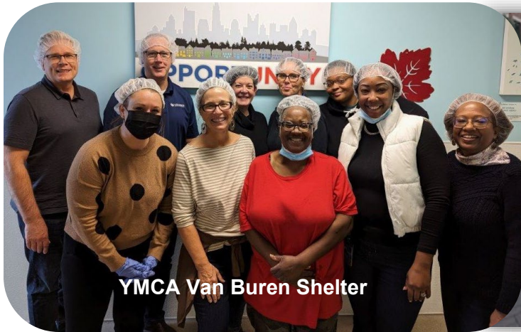
YMCA Van Buren Shelter