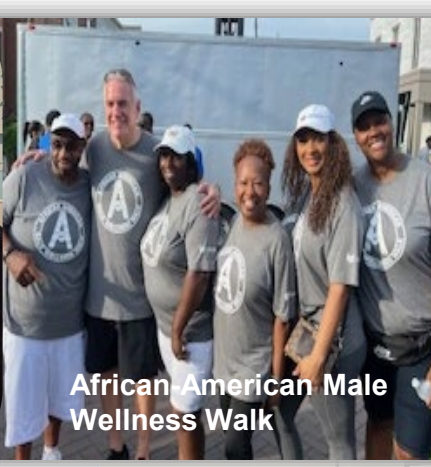
African-American Male Wellness Walk