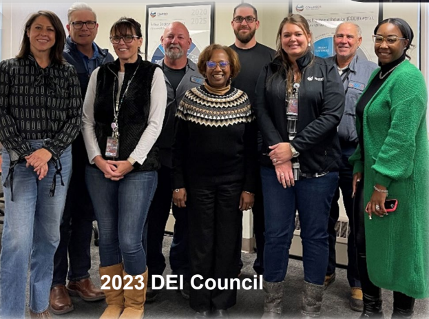
2023 DEI Council