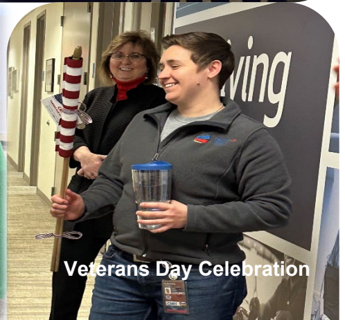
Veterans Day Celebration