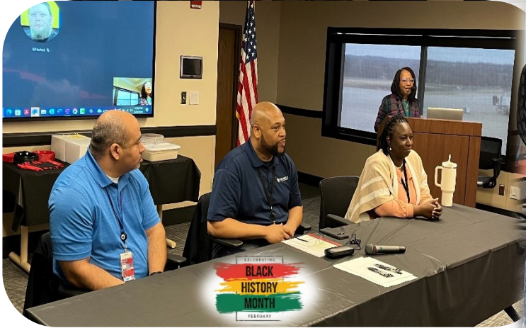
BLACK HISTORY MONTH FEBRUARY