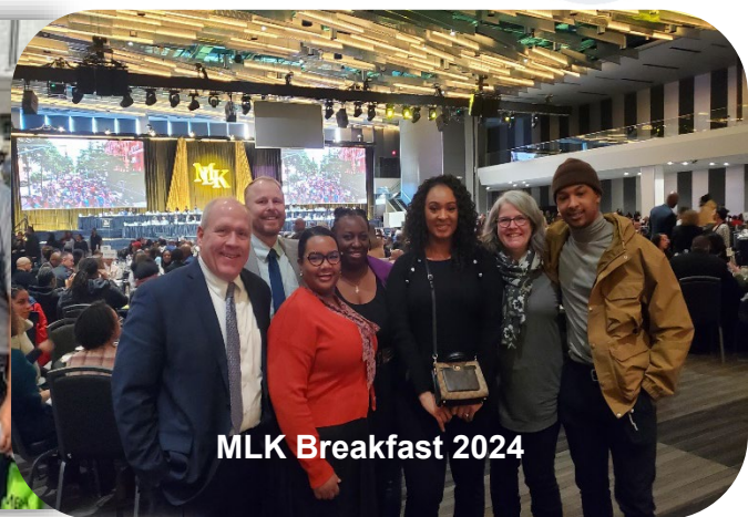
MLK Breakfast 2024